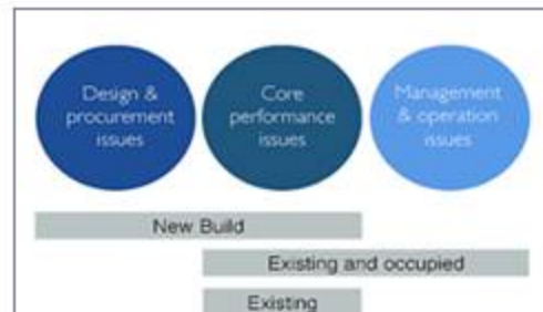
Figure 1. Structure & assessment process of BREEAM for offices.